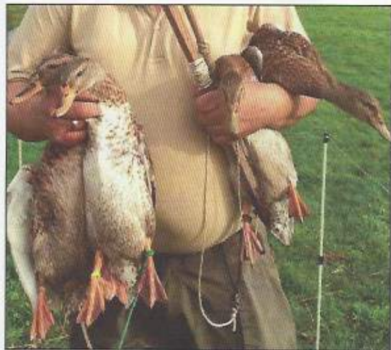
Live calling mallards are widely used in the Netherlands.

Eventually about 20 percent of the geese ceased migrating and did what resident geese do best under perfect conditions—flourish. Their population increased 10-fold. Local crop deprecations went through the roof. About 200,000 acres were leased as “goose foraging areas” to mitigate crop losses, but geese can't read signs or discern