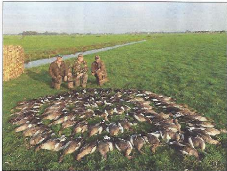
Depredation hunts in cooperation with local farmers can produce impressive results.

The banded mallard Cooper retrieved during a jump-shoot seemed poor consolation for the Egyptian goose taken the week before. During that fateful day we had watched a steady parade of barnacle geese fly over us in countless waves on their way to a freshly plowed sugar beet field. While deliberating what to do