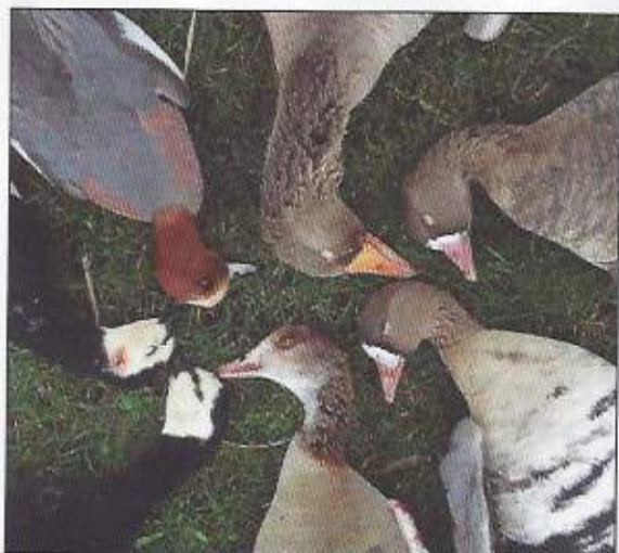
Clockwise from lower left: barnacle geese, Eurasian wigeon, greylag, whitefronts and Egyptian goose.

pigeons are also available. The Dutch are adamant about shooting every crow possible, and because they fly, we're always happy to oblige our hosts between goose volleys. Pink-footed geese and all other duck species are strictly protected.